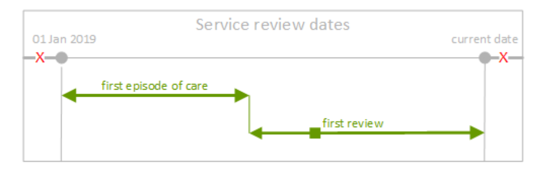
Figure 2 Service review dates